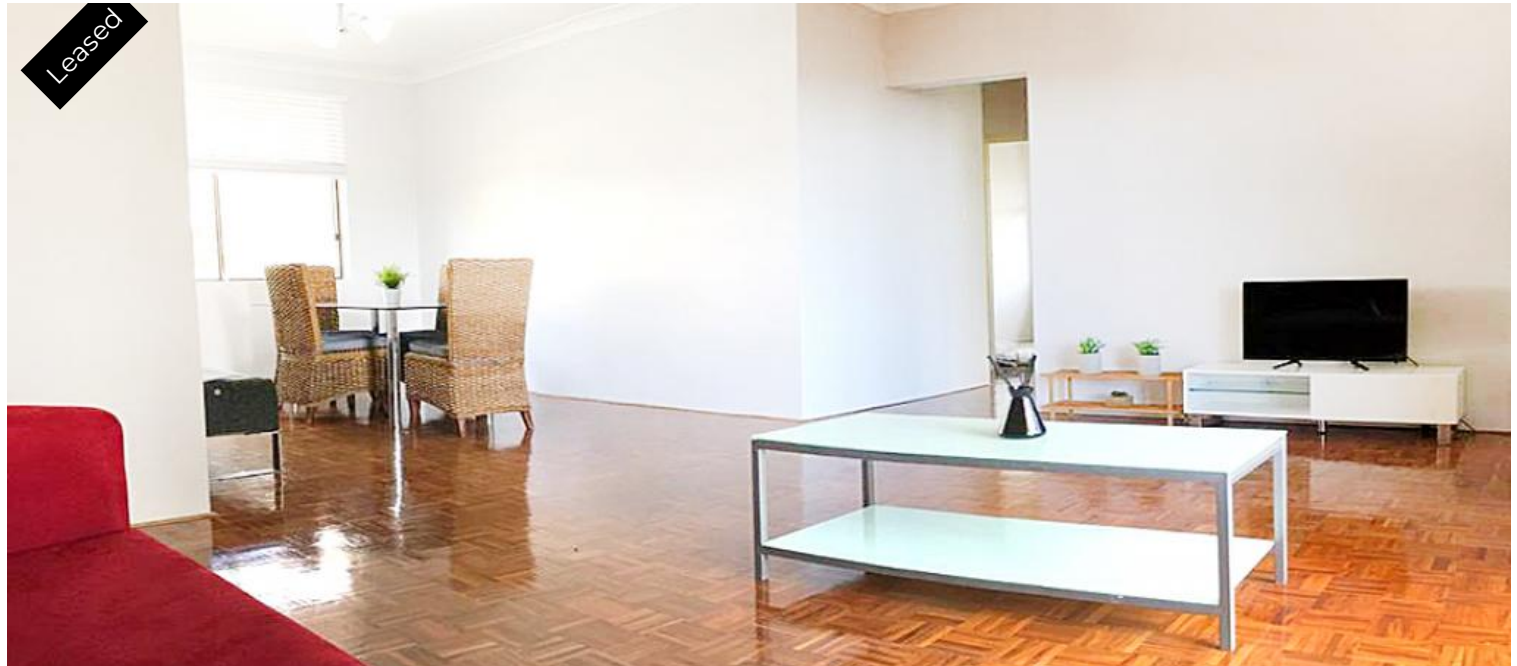
Unit 9, 27 Penkivil St, Bondi